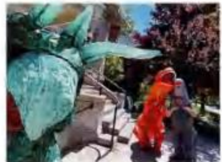
Dino Selfie School Tours May 2026

Thank you to the HPL Board of Trustees, Staff, Friends of the HPL and all of our Volunteers!