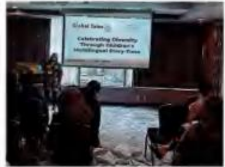
Eba Presenting at the Youth Services Conference, Buffalo, NY April 2026