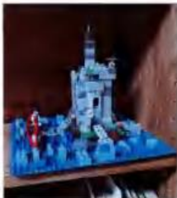
Tiny Builders Club April 2026