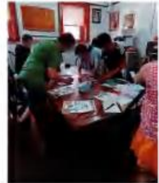
Teen Program: Escape Room April 2026