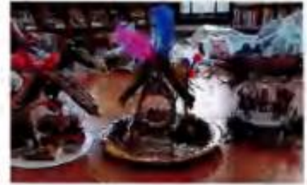
Fairy House Fish Bowls Adult Crafting April 2026