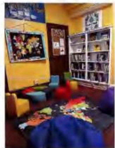
Global Hub April 2026

Thank you to the HPL Board of Trustees, Staff, Friends of the HPL and all of our Volunteers!