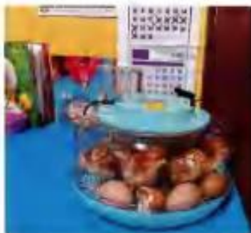
Baby Chickens Hatched at the Library April 2026