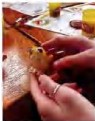
"Fakemon" Teen Program March 2026