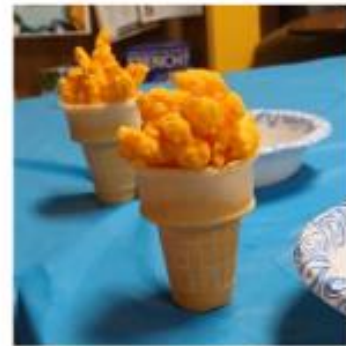
Edible Torches Olympic Themed Global Tales February 2026