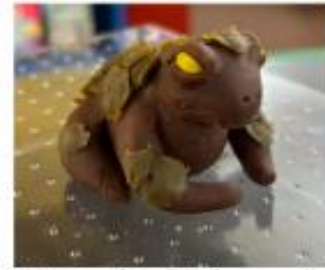
Upcoming "Fakemon" Teen Program March 2026