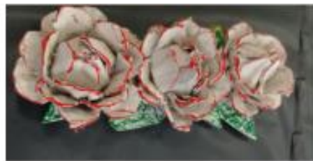
Adult Crafting: Egg Carton Roses March 2026